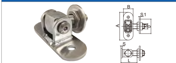
不锈钢带板圆片铰链 Adjustable Gate Hinge (304, stainless steel)