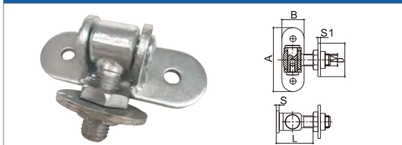
带板圆片铰链 Adjustable Gate Hinge