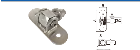
不锈钢带板螺帽铰链 Adjustable Gate Hinge (304, stainless steel)