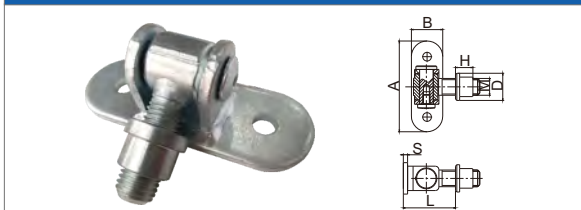
带板螺帽铰链 Adjustable Gate Hinge